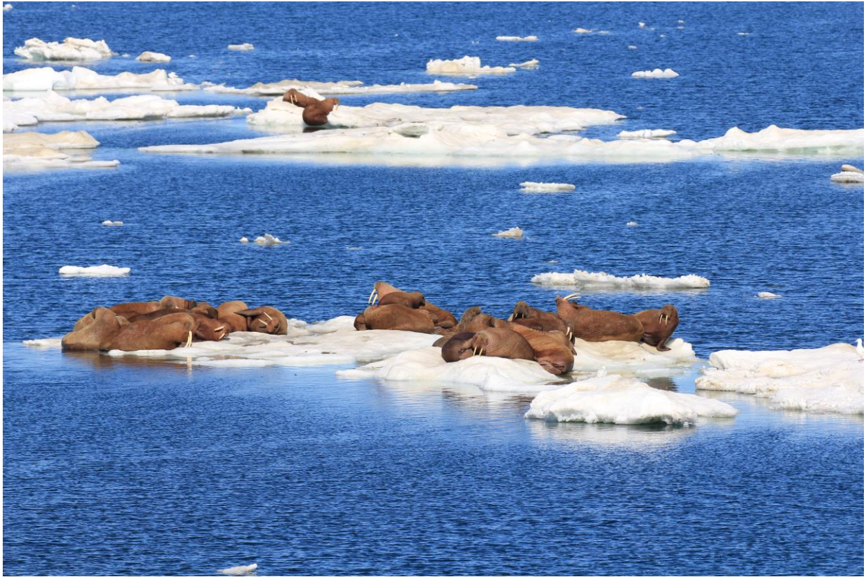
Figure 10. Several walrus groups on sea ice