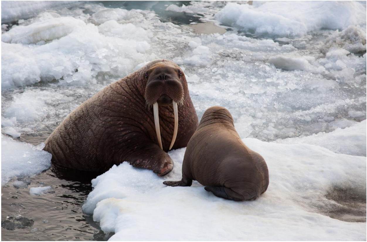
Figure 9. Walrus adult female and calf