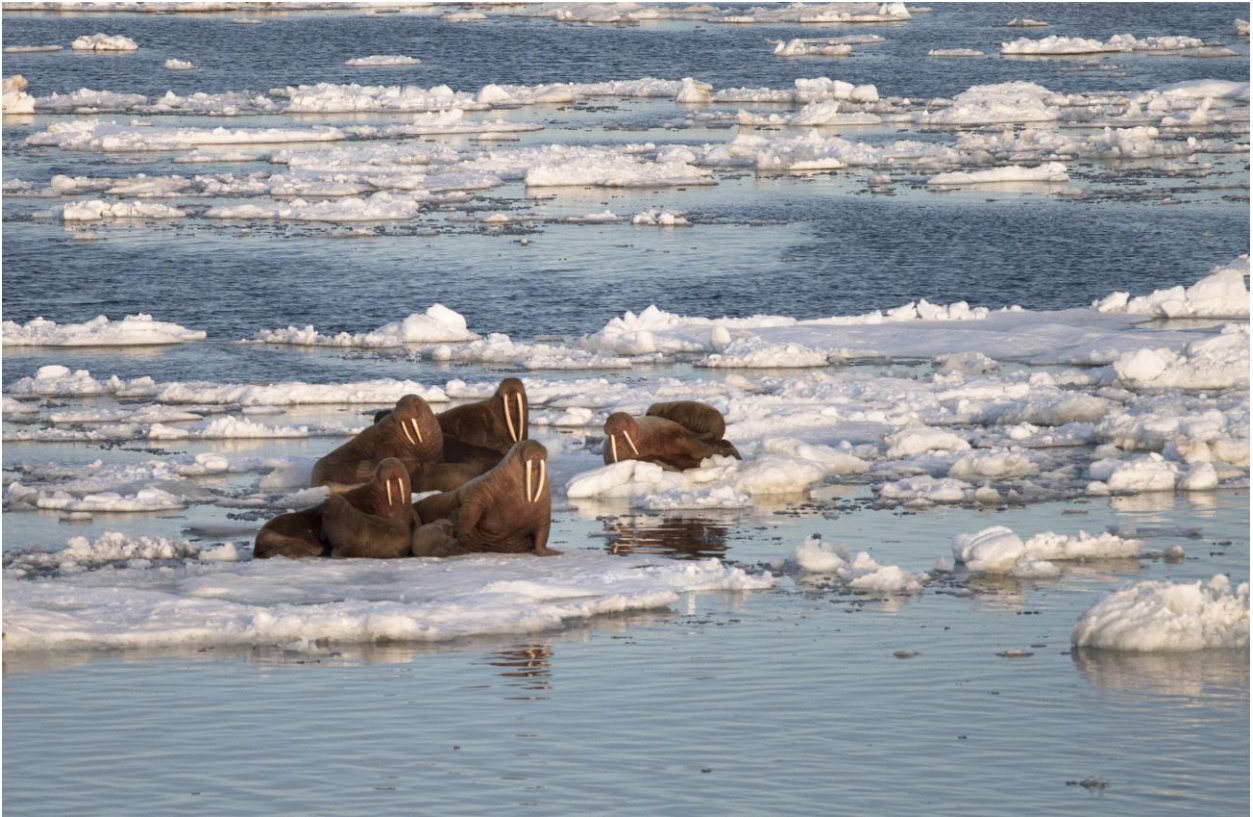
Figure 8. Several walrus groups on sea ice.