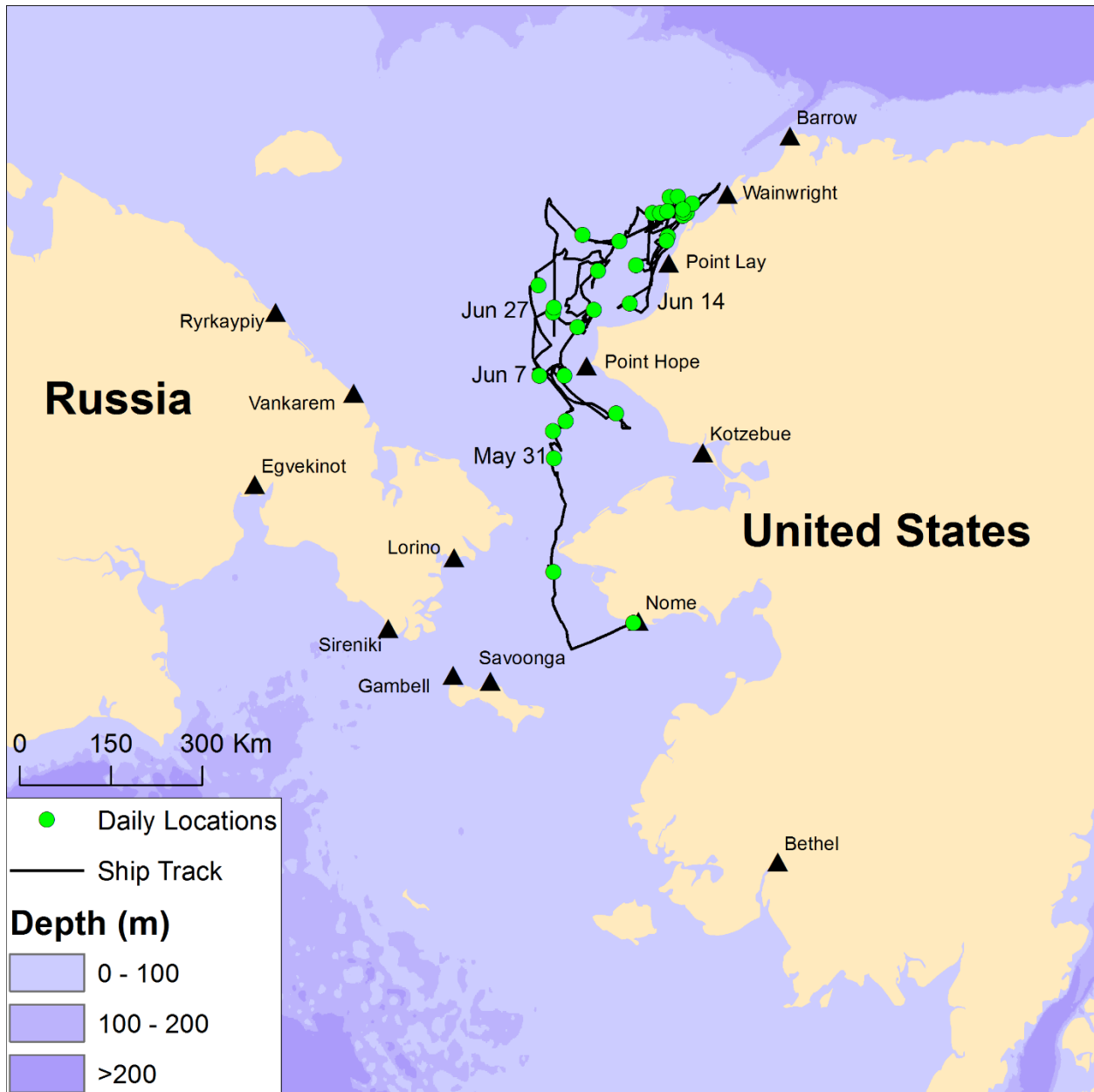
Figure 2. Walrus cruise tracks 2014

Walrus research cruise tracks from 2014. The cruise was conducted from the RV Norseman II .