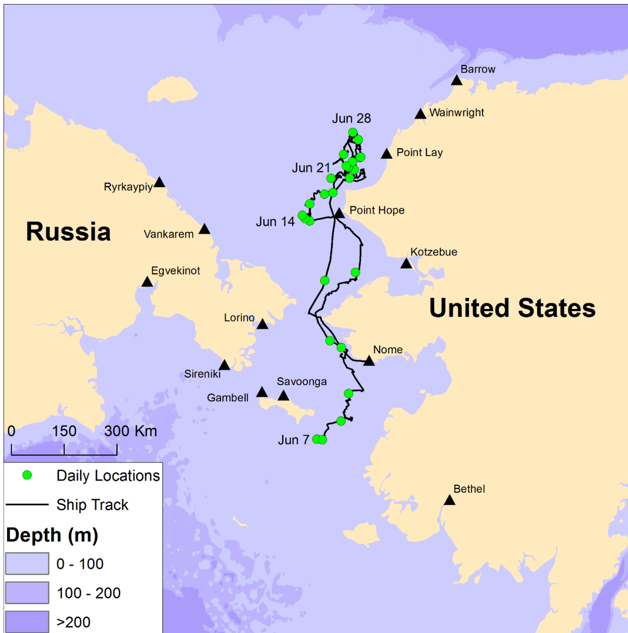
Figure 1. Walrus research cruise tracks from 2013

Walrus research cruise tracks from 2013. The cruise was conducted from the RV Norseman II .