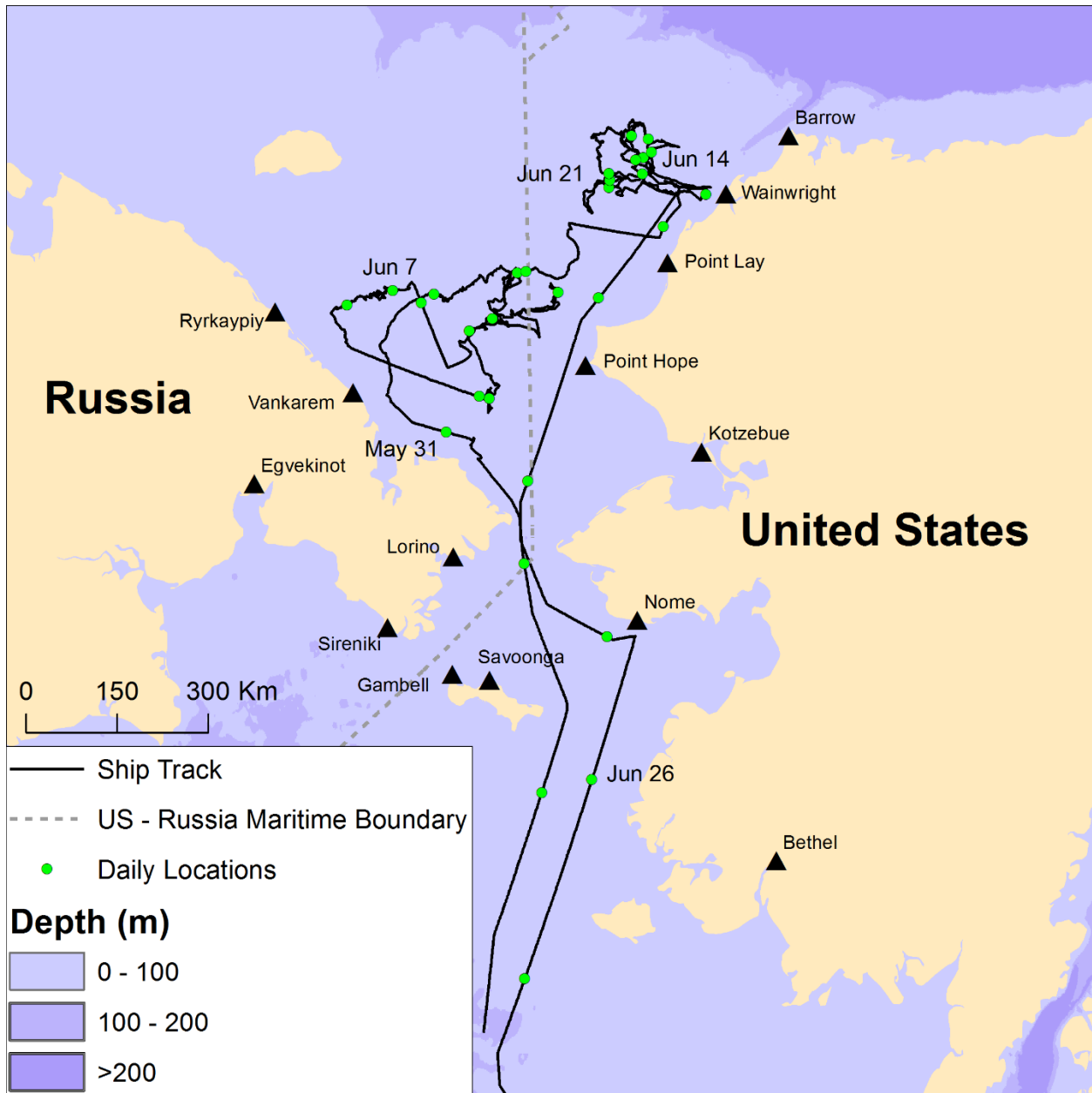
Figure 3. Walrus cruise tracks 2015

Walrus research cruise tracks from 2015. The cruise was conducted from the RV Professor Multanovskiy .