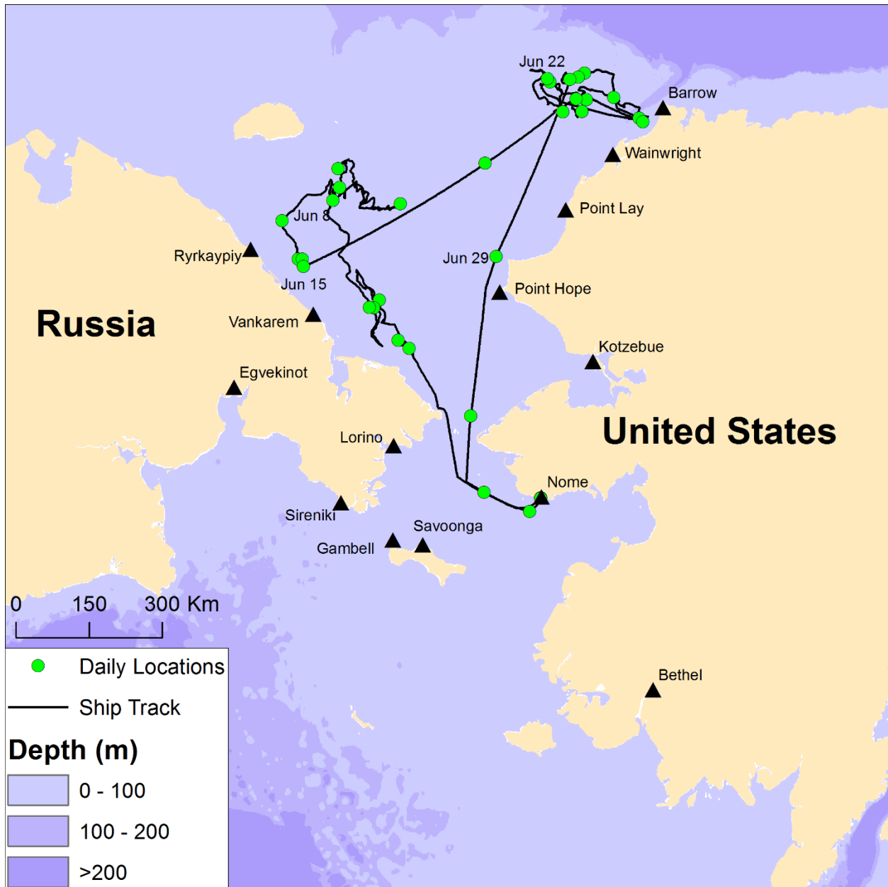
Figure 5. Walrus cruise tracks 2017

Walrus research cruise tracks from 2017. The cruise was conducted from the RV Professor Multanovskiy .