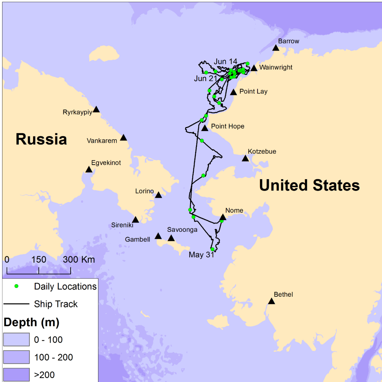
Figure 4. Walrus cruise tracks 2016

Walrus research cruise tracks from 2016. The cruise was conducted from the RV Professor Multanovskiy .