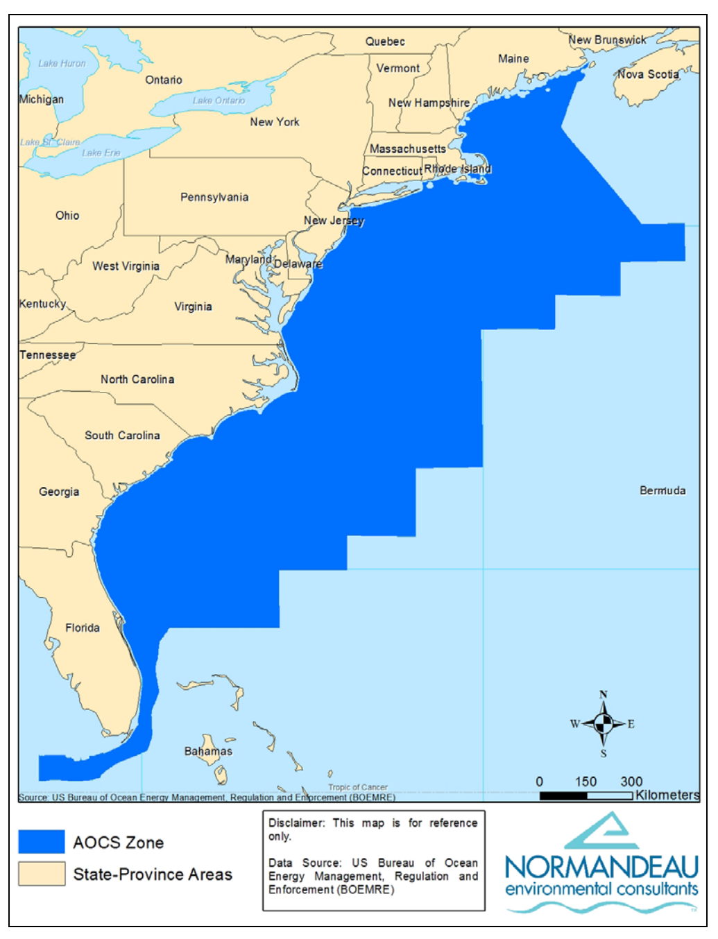
Figure 1. The geographic scope of the Atlantic Outer Continental Shelf.

thus exposed to potential impacts of developments, (3) incorporating breeding status, (4) incorporating macro-avoidance behavior in both collision and displacement indices, and (5) including uncertainty measures in our vulnerability assessments to represent either lack of data or data containing conflicting information. The set of scoring criteria and provisional scores for bird species is based on evidence taken from reviewed literature. We started with the methodological structure established by Furness and Wade (2012) and Furness et al. (2013), then reviewed all scores allocated by Garthe and Hüppop (2004), Furness and Wade (2012), and Furness et al. (2013), and assessed which of these were appropriate in the context of the AOCS geographic scope (Figure 1).